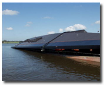
CLICK HERE to view the "launch" video.

"Our 2009 presentations will represent the broad range of issues that impact the eleven founding